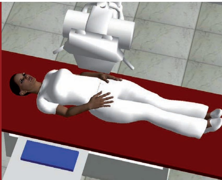
The Teesside simulator works like a computer game. Students use the mouse to position equipment in the virtual xray room. Once they are happy with the positioning the xray image is displayed.